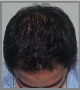
AFTER 90 DAYS